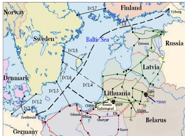
Figure 1. Russia's Controlled Electricity Infrastructure in the Baltics

Although Lithuania and the other two Baltic states have attained political independence, they still belong by virtue of electricity and gas imports to Russia's sphere of influence (Fig.1). Apparently, Russia has no intention to strong-arm the Baltic states over energy issues, since the sale of energy to them provides Russia substantially better margin of profits than sales, for example, to western Europe. Being the sole supplier of energy resources, Russia has a tremendous amount of leverage over the three countries in terms of their price and delivery. To break away from this dependence, Lithuania and its partners Latvia and Estonia announced their intention in 2004 to build a new nuclear plant that would provide them the needed electric power and thus free them of imports from Russia. However, for nearly four years, while the second reactor of INPP was still operating, Lithuania showed little initiative in firming up the plans to build the new NPP.