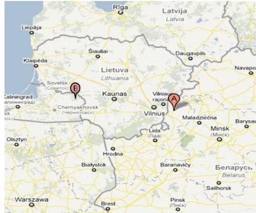
Figure 3. Future Russian Nuclear plants on both sides of Lithuania